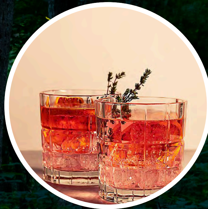
DRINKS & COCKTAILS