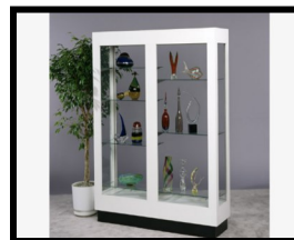
SEE THRU WALL CASE REGULAR WALL CASE

The above (3) cases are 38" high, 20" deep, lights & locks, White Finish (Electrical Outlet NOT included)