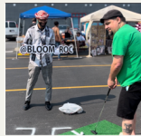
Community Outreach Leaders