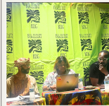
Providing Educational Learning Experiences