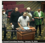
Bridging Gaps as Advocates