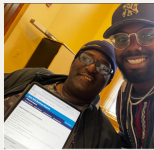
Technical Assistance Providers

Ensuring both access and resources are provided